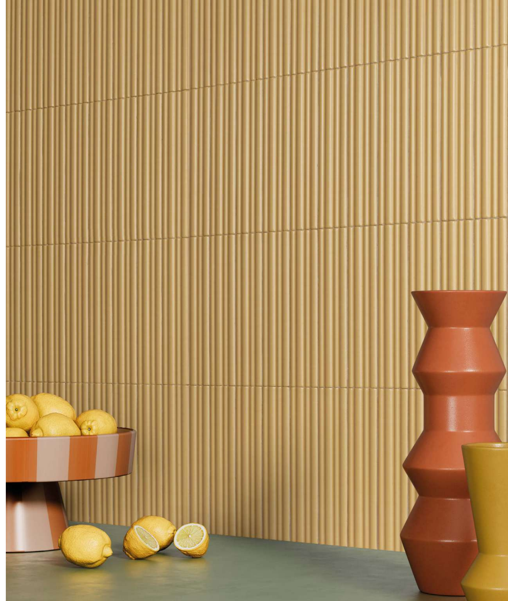
● RAINBOW GOLD/5X25