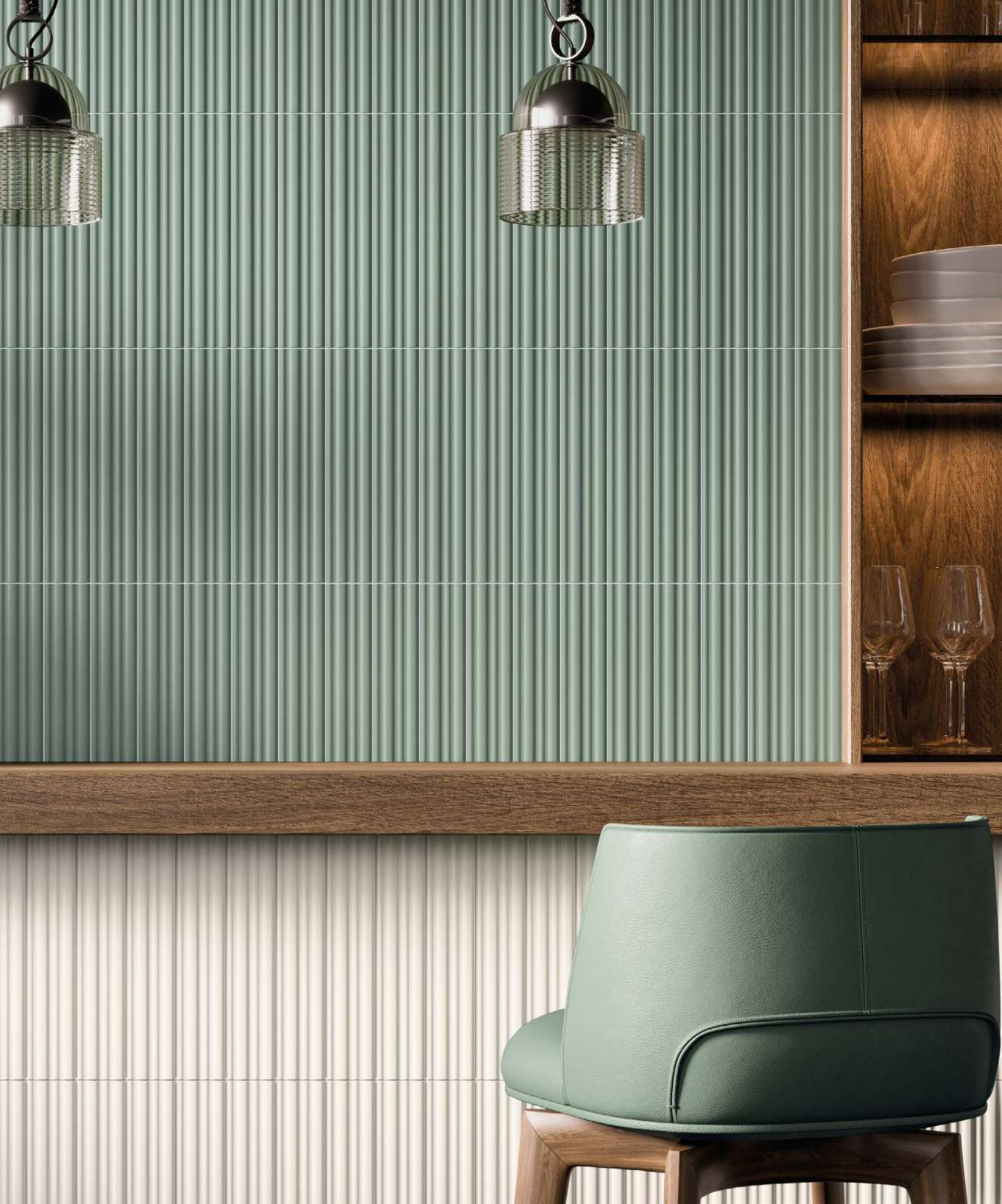
● RAINBOW GREEN/5X25 · RAINBOW WHITE/5X25