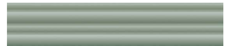
41738 RAINBOW GREEN/5X25 Q68 (5x25 cm — 2x9 13/16 "*) ** 18 Kerakoll