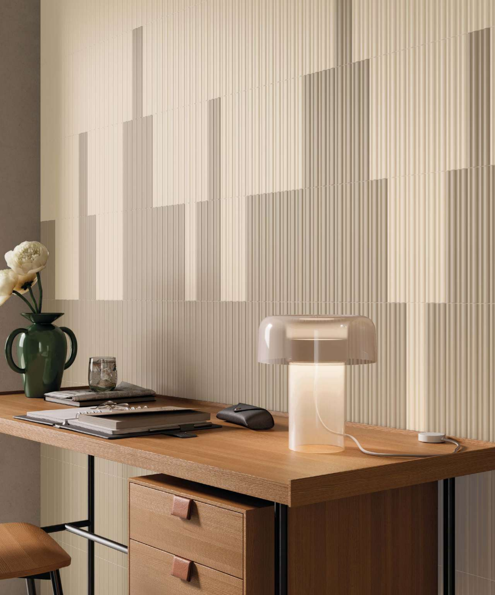
● RAINBOW SAND/5X25 · RAINBOW TAUPE/5X25