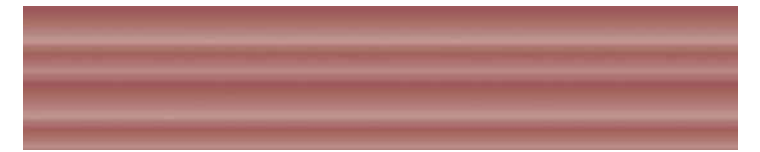
41740 RAINBOW CHERRY/5X25 Q68 (5x25 cm — 2x9 13/16 "*) ** 40 Kerakoll