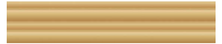
41739 RAINBOW GOLD/5X25 Q68 (5x25 cm — 2x9 13/16 "*) ** 29 Kerakoll