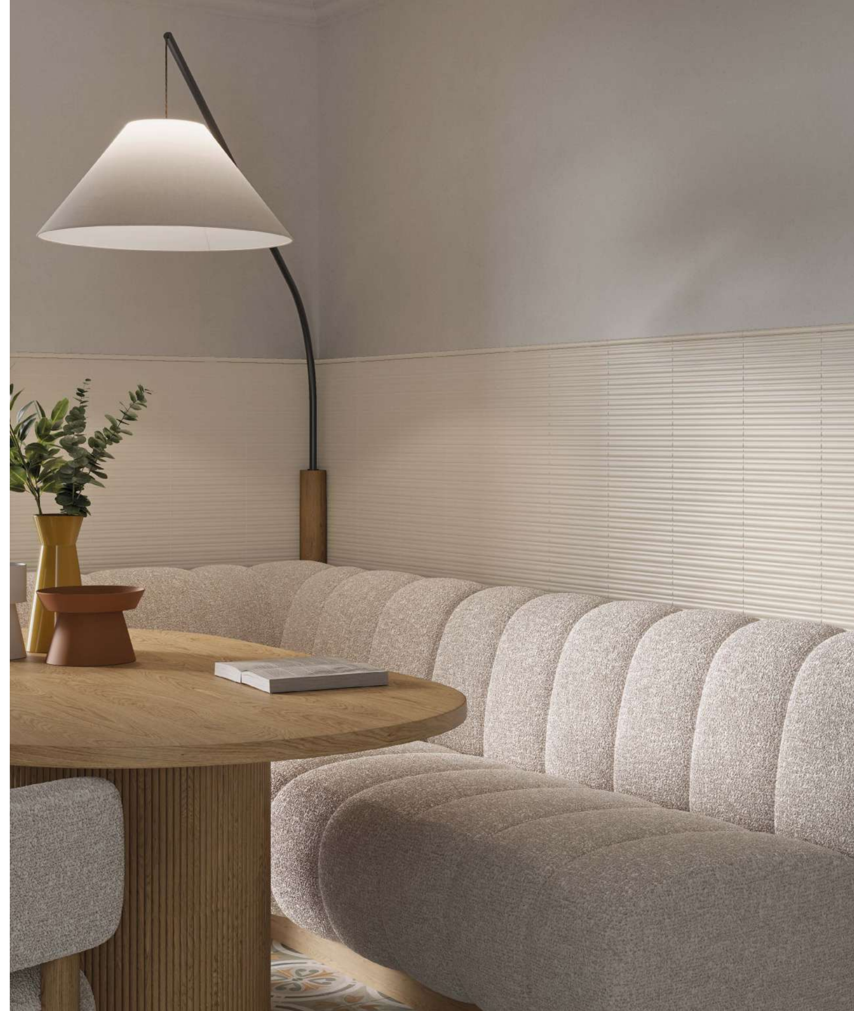
● RAINBOW SAND/5X25 · ING. RAINBOW SAND/1,5X25