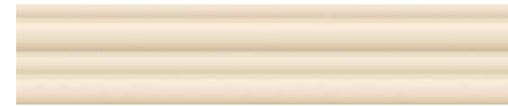
41736 RAINBOW SAND/5X25 Q68 (5x25 cm — 2x9 13/16 "*) ** 22 Kerakoll