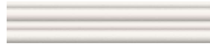
41735 RAINBOW WHITE/5X25 Q68 (5x25 cm — 2x9 13/16 "*) ** 01 Kerakoll